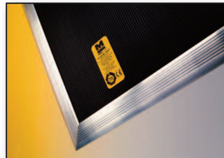
Black Ribbed Top