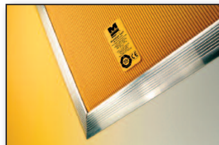
Yellow Ribbed Top